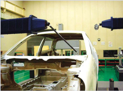
Measurement example for dual-ram type (Simultaneous use of touch-trigger probe and line laser probe)