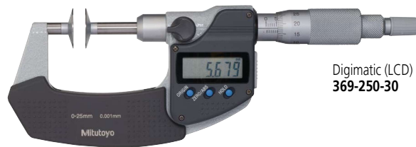
Digimatic (LCD) 369-250-30