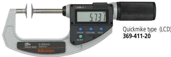
Quickmike type (LCD) 369-411-20