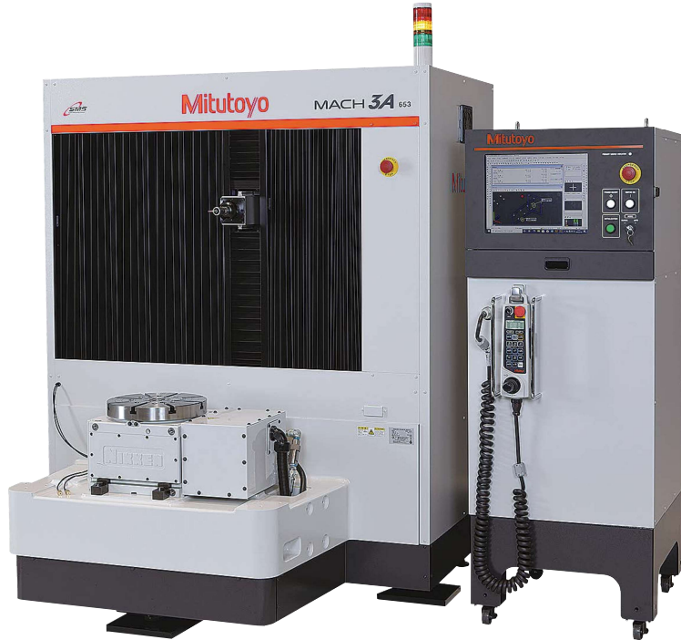
MACH-3A 653 The indexing table shown is optional